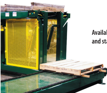
Available with optional incline belt and stacker take-away (shown).