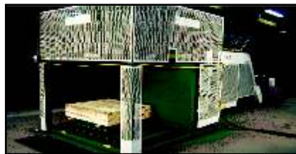
Finished stacks are easily accessed prior to movement to the next work station.